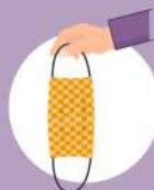
Inspect the mask for damage or if dirty