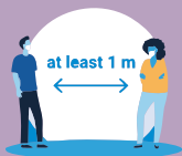
Maintain a distance of at least 1 metre from others