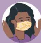
Avoid touching the front of the mask