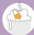
Wash the mask at least once a day, preferably with hot water