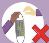
Do not share masks with others